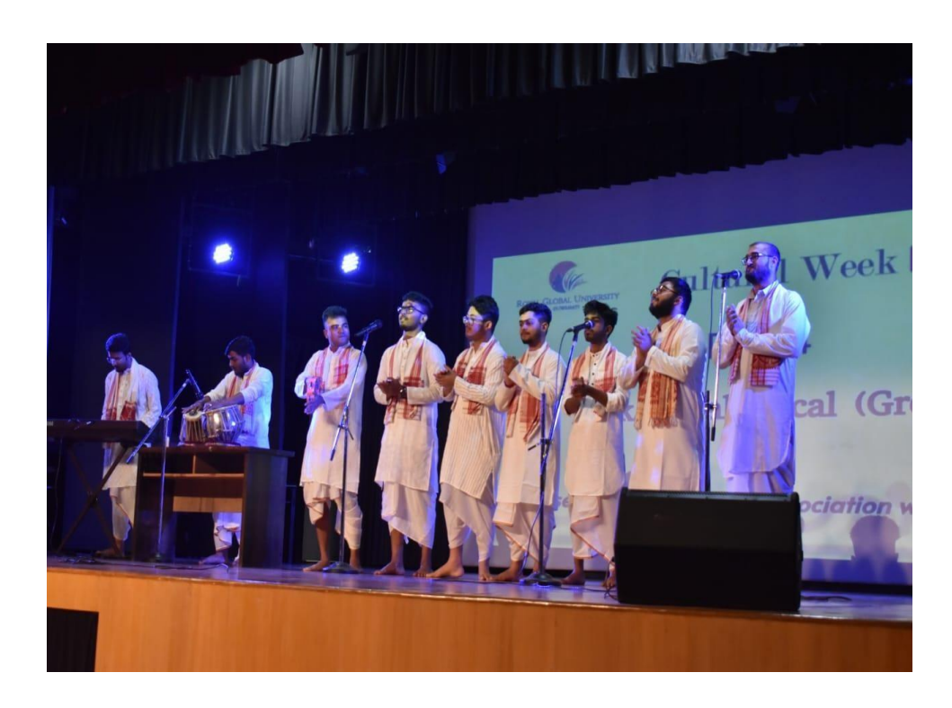
16. 6 <sup>th</sup> April 2023: The Cultural procession marked the end of the RGU Varsity Cultural Week, Students from all schools participated in the cultural procession which was a competitive event.